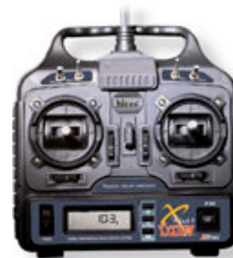
Hitec Flash 5X

It is possible to start with a simple 2 channel radio, but if you intend to progress past basic models, it may be as well to spend a little more on at least a 4 channel radio. The following are a few pictures of available radio's in the £100- £200 bracket