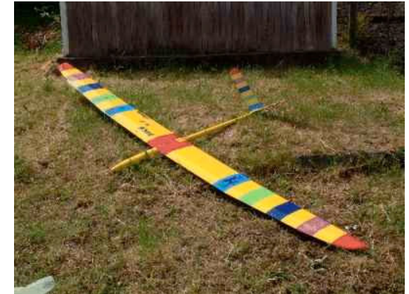
A Pike WR

The thermal models can be used on the slope in light wind conditions